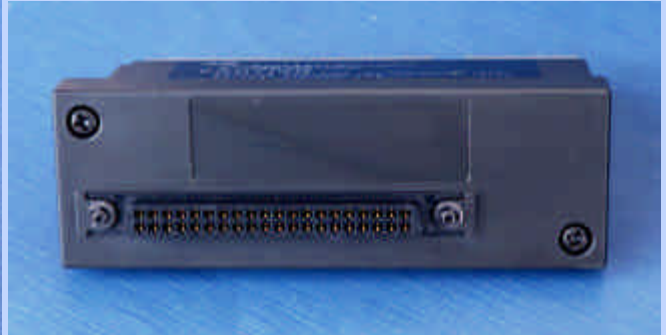
40P connectors on back